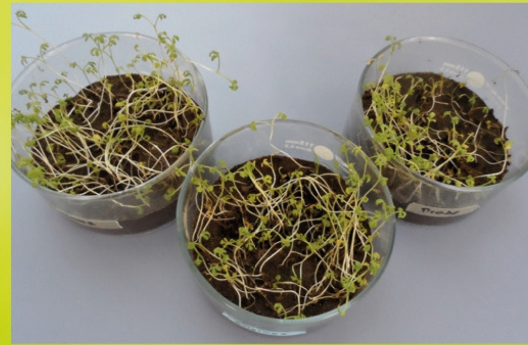
Fig. 2: Total samples without and with the Biodegradable test specimen after 30 days

The biological activity is monitored in standardised test soil under aerobic conditions over the entire test period on the basis of various parameters (temperature, soil moisture). The tests can be carried out either in predefined laboratory conditions or in practical field conditions. After a specified test period, we evaluate the tests with regard to the degradation rate of products as well as the environmental compatibility and impact of decaying products (conducting ecotoxicological tests or chemical analyses). Standardised procedures are used for each of these end parameters.