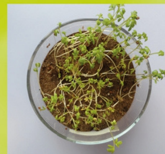
Test specimen 1 after 11 days