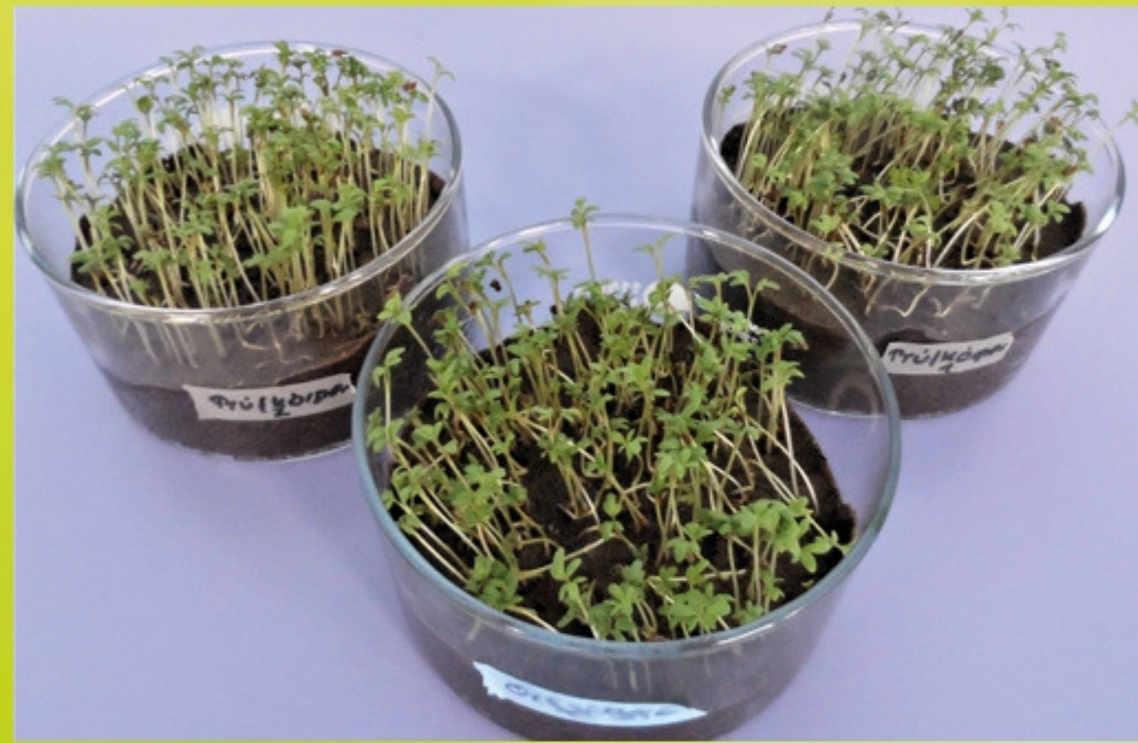
Fig. 1: Total samples without and with test specimen after 5 days

As regards the biodegradability of plastics, the origin of the raw material, i.e., whether fossil or renewable raw materials were used in the manufacture of the product, is irrelevant. The only factor that determines whether a material is biodegradable is its chemical structure. Plastic is only biodegradable if microorganisms and fungi, or their enzymes, are able to break down and completely metabolise the molecules that make up the plastic. Biodegradable plastics are completely decomposed by microorganisms to carbon dioxide (CO 2 ), water (H 2 O), mineral salts and biomass. Additionally, methane (CH 4 ) can be produced in a fermentation process during decomposition.