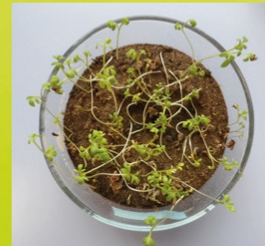
Original sample after 11 days

The biological activity is monitored in standardised test soil under aerobic conditions over the entire test period on the basis of various parameters (temperature, soil moisture). The tests can be carried out either in predefined laboratory conditions or in practical field conditions. After a specified test period, we evaluate the tests with regard to the degradation rate of products as well as the environmental compatibility and impact of decaying products (conducting ecotoxicological tests or chemical analyses). Standardised procedures are used for each of these end parameters.